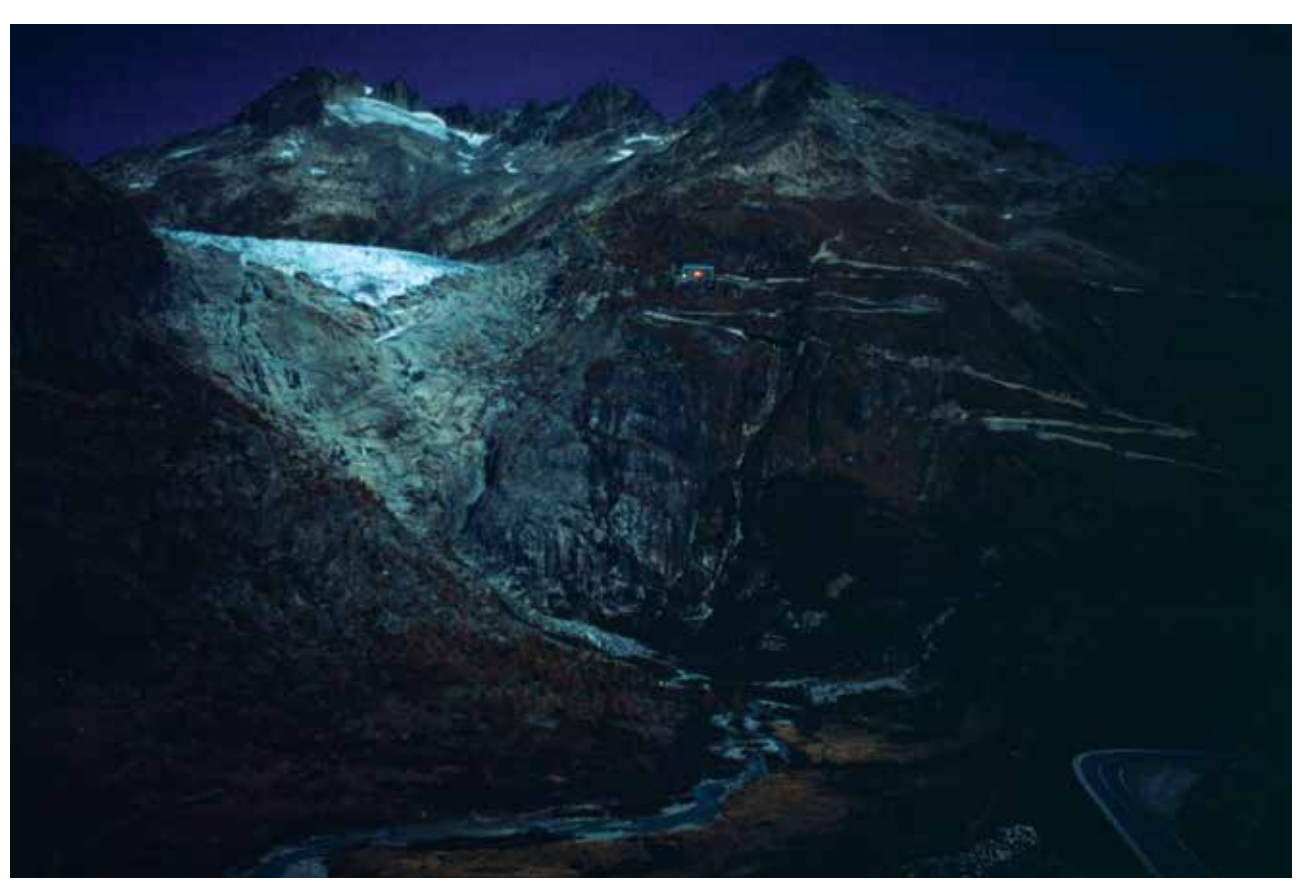
Andreas Züst, untitled (from the series Nacht), 1995