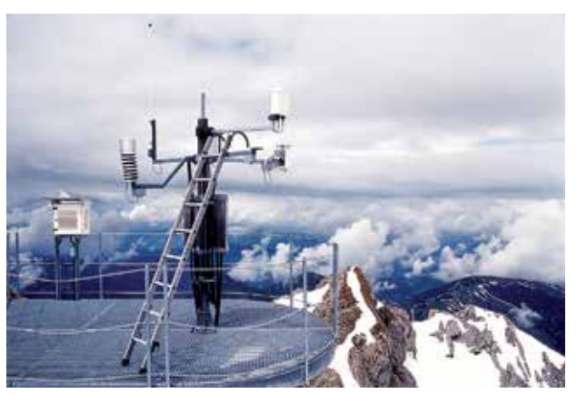
Andreas Züst, untitled (Säntis), 2000